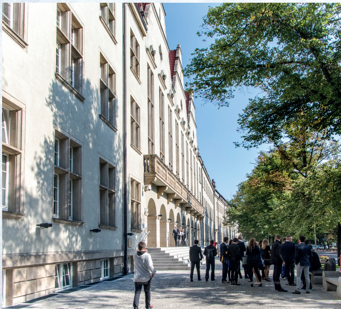
Wrocław University of Science and Technology, the Main Building

In its own way Wrocław seems to specialize in education of engineers, particularly in the IT and communications fields, who can easily find employment in the city itself or anywhere in the world. The university not only maintains lively contacts with teaching and research institutions from all over the world but at the same time with the industry. Thanks to the co-operation agreements signed, students and employees of Wrocław University of Science and Technology have the opportunity to take part in joint research projects, students can also do internships or write their diploma theses which are at the same time practical solutions and ideas to be implemented.