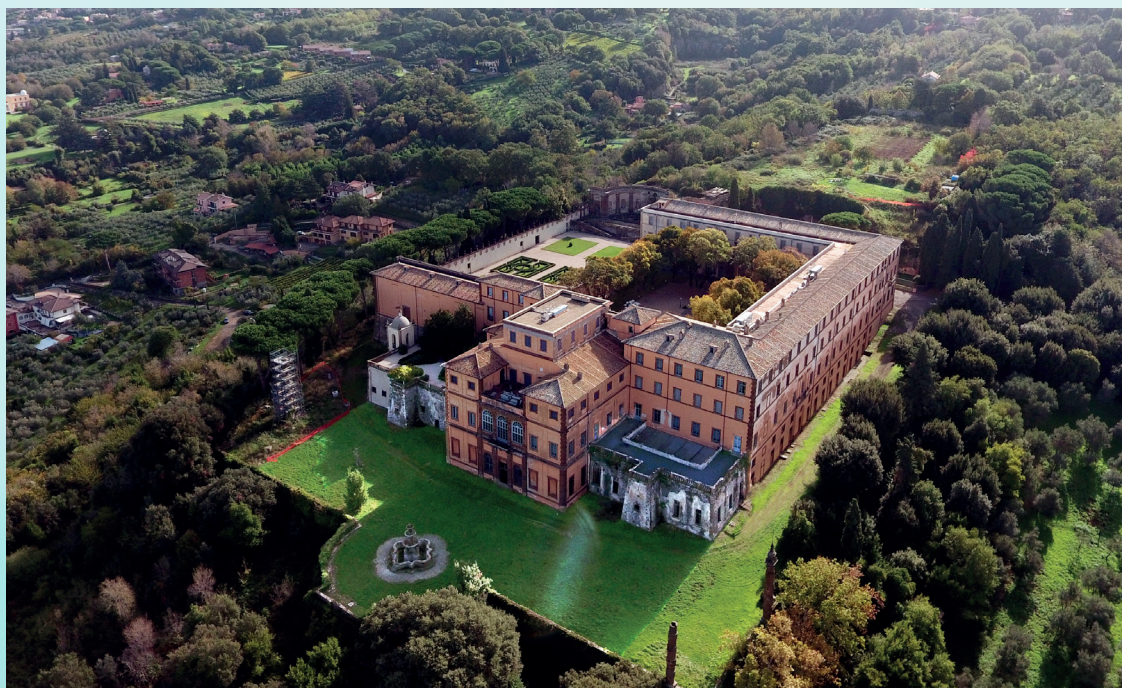
Villa Mondragone - University of Tor Vergata Congress Center

Furthermore, Villa Mondragone, one of the most beautiful among the Tuscolana villas, has become the University of Tor Vergata Congress Center. It is remembered as the “House of Life” for having hosted and saved children from the Holocaust. Many prestigious national and international congresses are yearly held at Villa Mondragone.