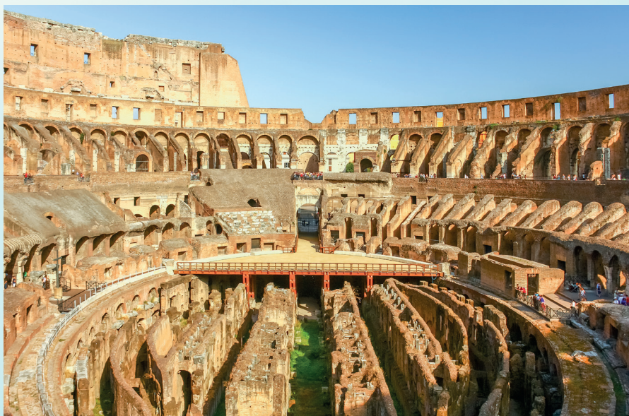
A look inside the Colosseum

Rome embraces Tor Vergata: let Tor Vergata embrace you!