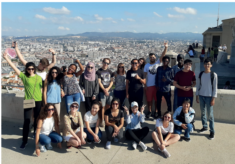
Integration week, September 2019

All first-year-CNE students will participate in Marseille in the Integration Week which will take place from the 13th to 18th September 2021. This is the obligatory activity for all first year students.