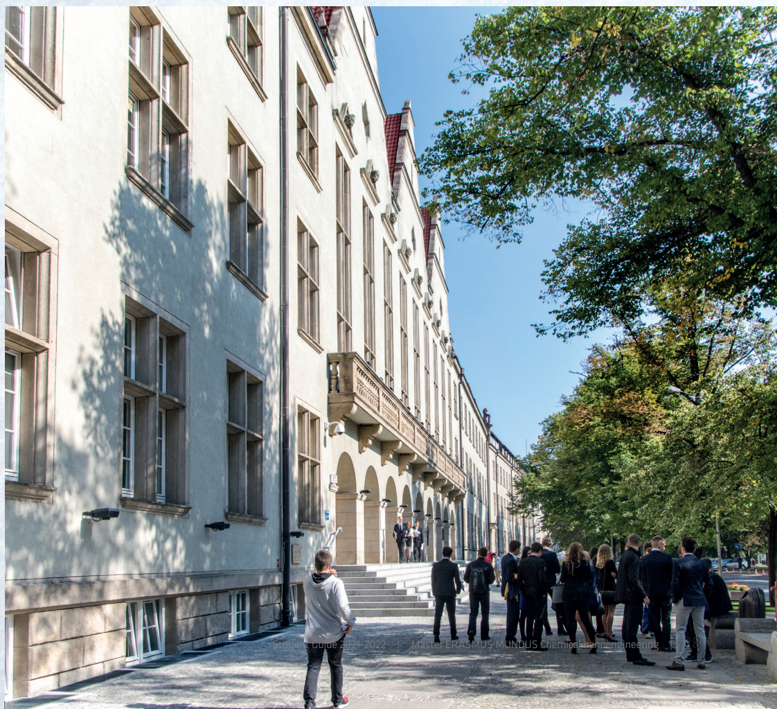
Wrocław University of Science and Technology, the Main Building

In its own way Wrocław seems to specialize in education of engineers, particularly in the IT and communications fields, who can easily find employment in the city itself or anywhere in the world. The university not only maintains lively contacts with teaching and research institutions from all over the world but at the same time with the industry. Thanks to the co-operation agreements signed, students and employees of Wrocław University of Science and Technology have the opportunity to take part in joint research projects, students can also do internships or write their diploma theses which are at the same time practical solutions and ideas to be implemented.