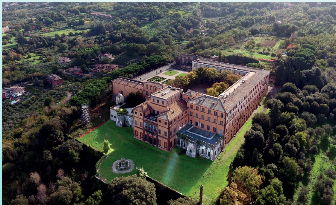
Villa Mondragone - University of Tor Vergata Congress Center

Furthermore, Villa Mondragone, one of the most beautiful among the Tuscolana villas, has become the University of Tor Vergata Congress Center. It is remembered as the “House of Life” for having hosted and saved children from the Holocaust. Many prestigious national and international congresses are yearly held at Villa Mondragone.